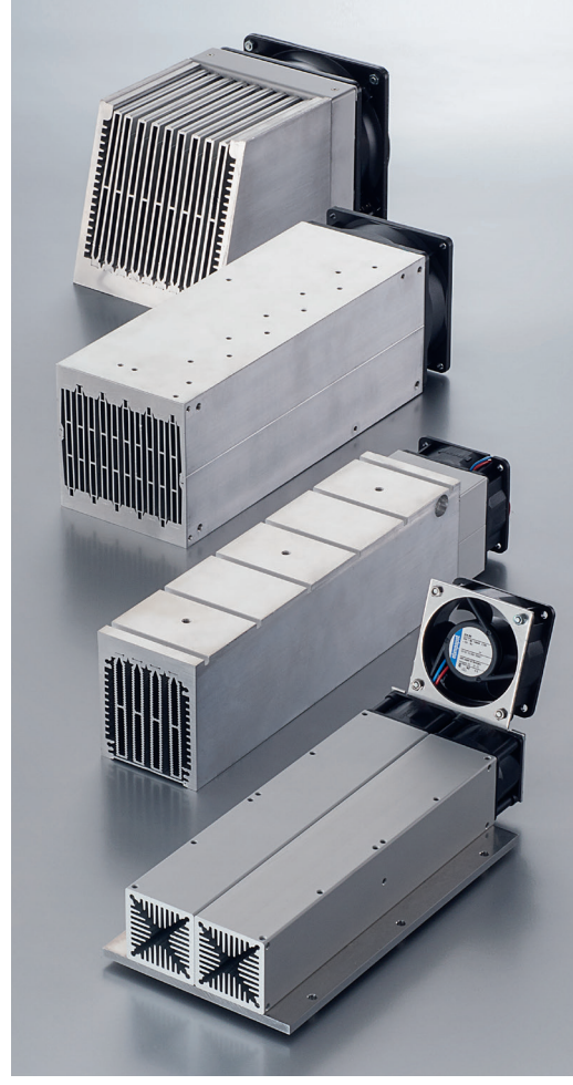
of heat dissipation can now be found in all areas of industrial power electronics. The aluminium base bodies of the units as a closed heat exchange structure in conjunction with axial, radial and diagonal fan motors offer efficient solutions for the heat dissipation of electronic components in power electronics.

Heat dissipation concepts for electronic parts and components receive an enormous increase in efficiency through the use of fan-assisted designs, the so-called fan units (Illustration 2). The design and geometry of the heat exchange surfaces of the fan units are matched to the corresponding fan motor and its specific characteristics in terms of air volume and air pressure and are also particularly suitable for the heat dissipation of larger power losses. Fan units are also based on convective heat transfer, but in contrast to free convection, depending on the design, a strong air movement is generated by various fan motors and directed through a heat exchange structure. Working on the principle of increasing the surface area, the physical properties of the various fan unit concepts, such as specific thermal conductivity, weight and size, volume and price per unit of heat dissipated, must also be taken into account. Different fan unit configurations for thermal management and for solving the problem